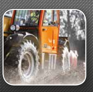
Driving Experience Longer wheel base provides greater stability and comfort when driving as well as landing loads.