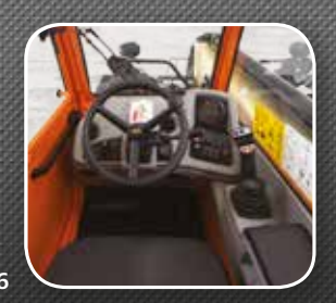
Cabin Controls Well spaced cabin with controls placed in front of the operator.

visibility, mechanical suspension seats, and thoughtfully positioned armrests all enhance operator comfort and productivity. Ultimately, these types of features make machines easier to rent.