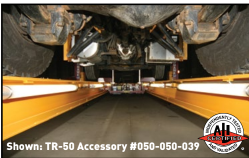
Shown: TR-50 Accessory #050-050-039