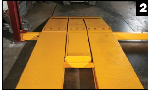
Optional 3rd wheel ramp available for 3 wheel forklifts.