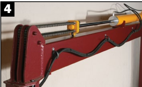
Large 5" cylinder with leaf chain drive system eliminates stretch, fray, pulleys and maintenance associated with cable driven lifts.