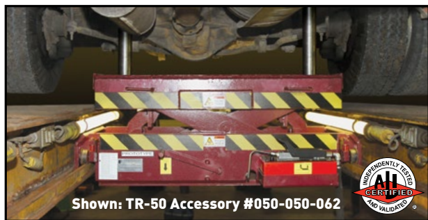
Shown: TR-50 Accessory #050-050-062