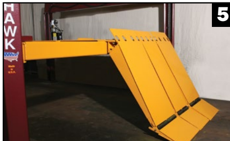
Approach ramps fold down out of the way when raised to act as a secondary automatic wheel stop.