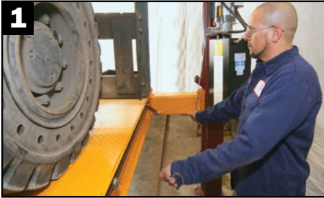
Two-handed safety release disengages all locks.