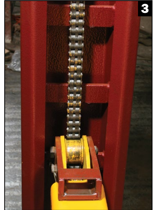
Mohawk mechanical locks engage the full length of travel.