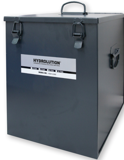
Steel Case - Package