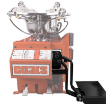
Point of Use Lift System (PN 85608609)