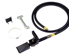
Auxiliary Bead Sealer (ABS) (PN 85606545)