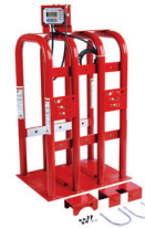
EL-X Express Lane Inflation System (PN 85607770)